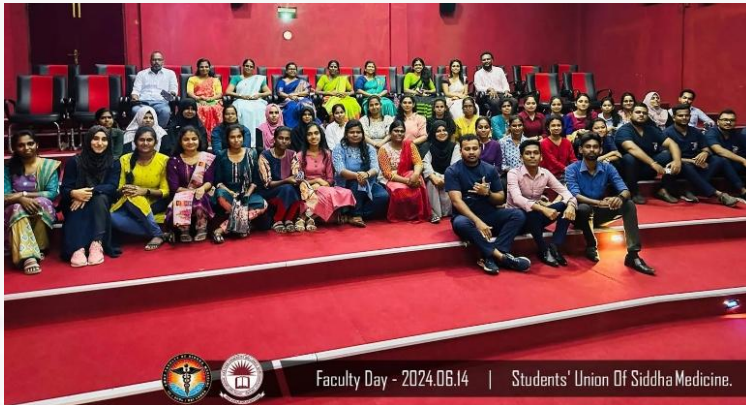
Faculty Day - 2024.06.14 | Students' Union Of Siddha Medicine.