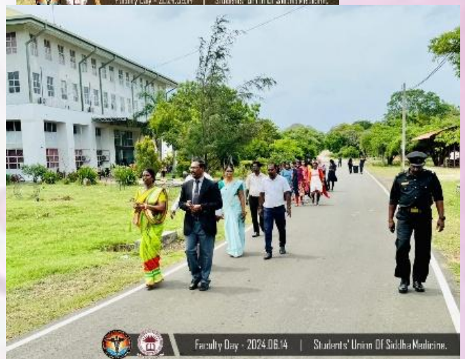
Faculty Day - 2024.06.14 | Students' Union Of Siddha Medicine.