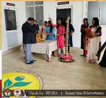
2024.06.14 | Students' Union Of Siddha Medicine.