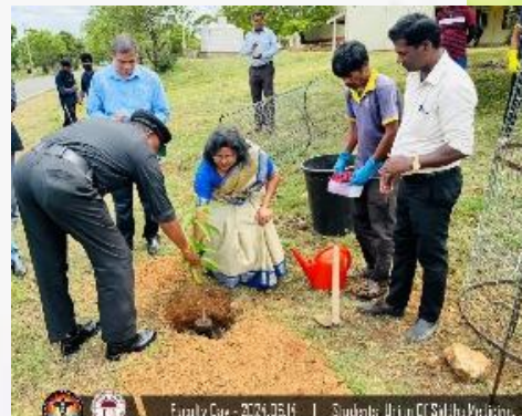
Faculty Day - 2024.06.14 | Students' Union Of Siddha Medicine.