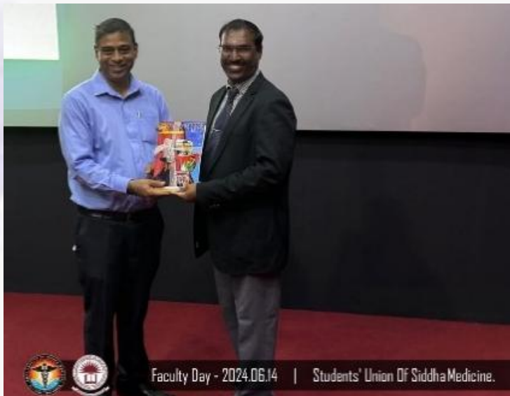
Faculty Day - 2024.06.14 | Students' Union Of Siddha Medicine.