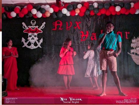
Nyx VALGOR Social Night