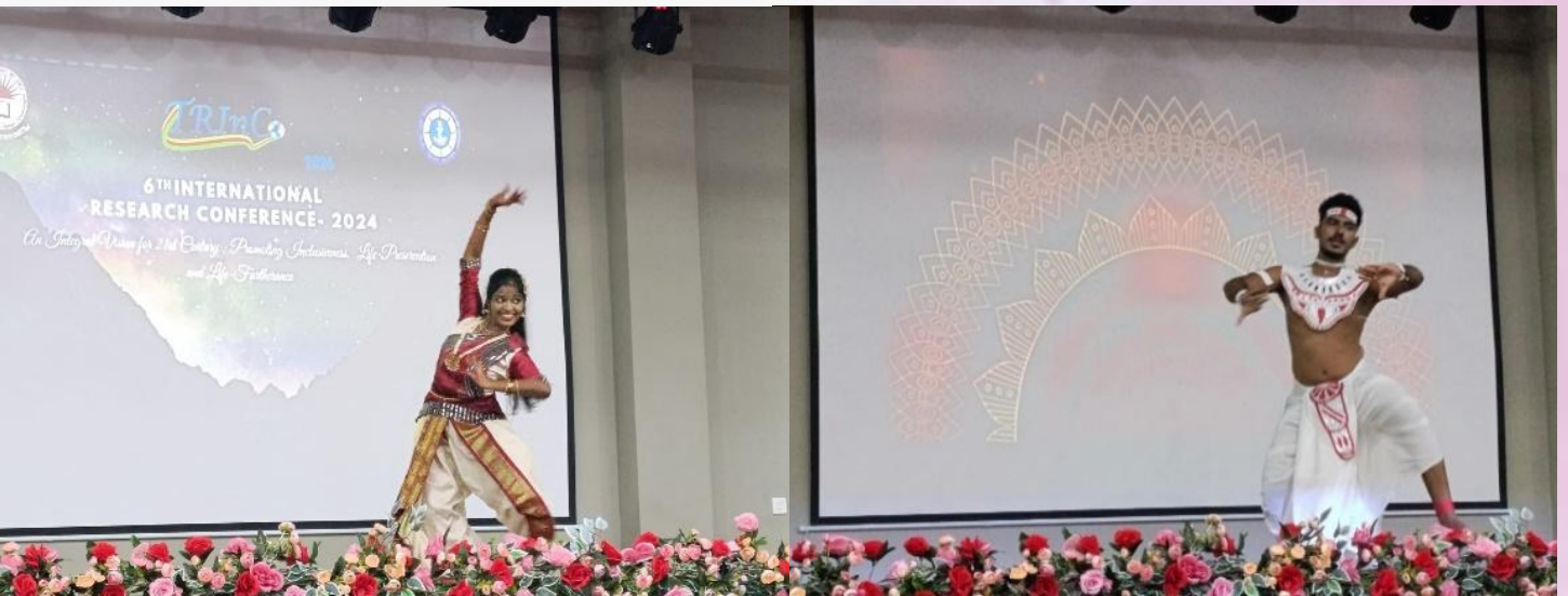
6 th INTERNATIONAL RESEARCH CONFERENCE - 2024