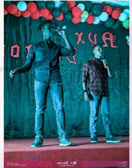
Nyx VALGOR Social Night